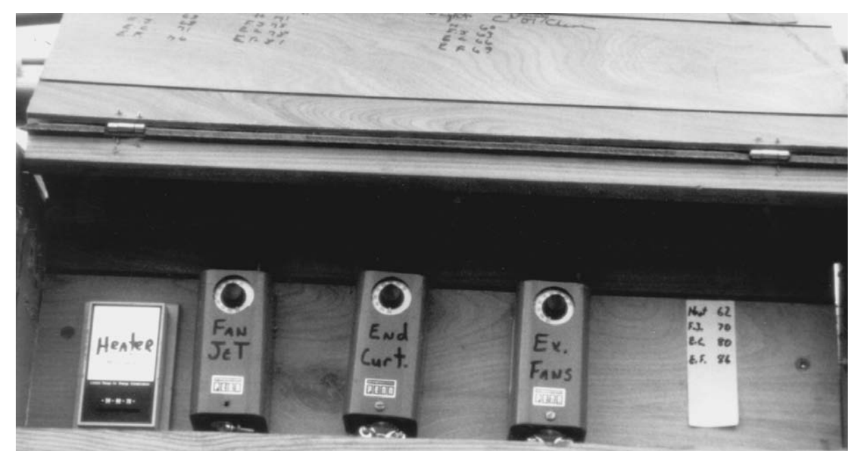
Locating thermostats in a box will avoid direct sun on them. An aspirated box is best.