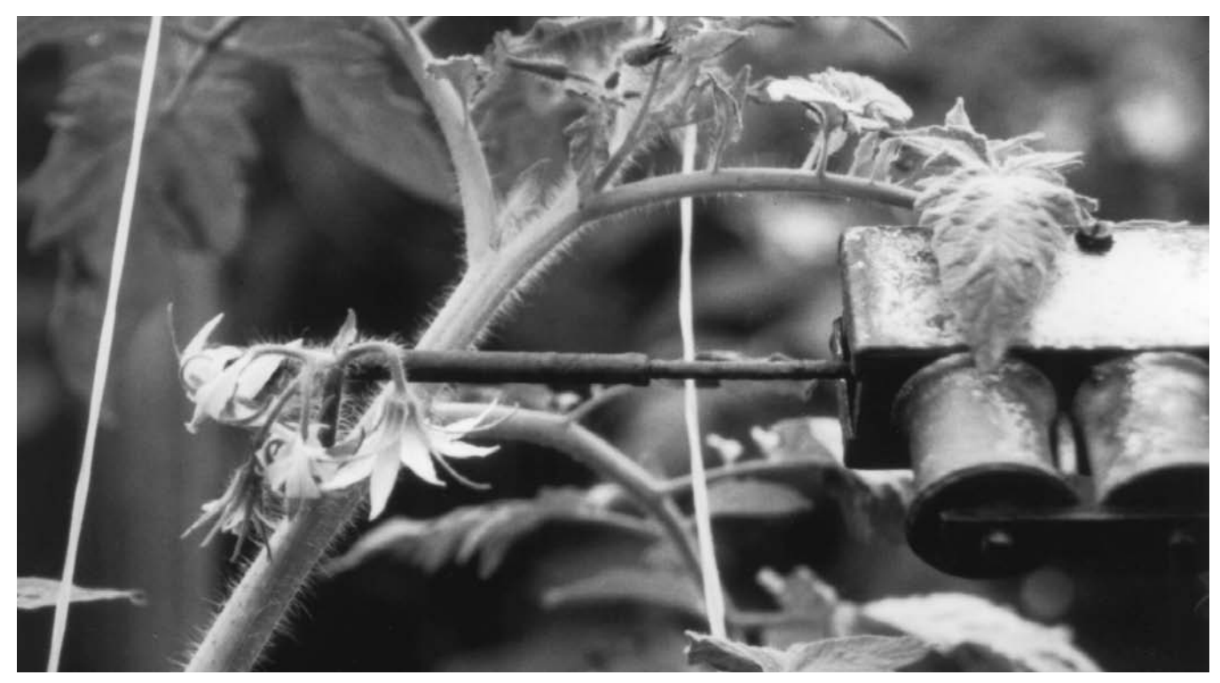
Touch the pollinator wand to the upper side of each pedicel (flower stem). Do not touch individual flowers.

In a hobby greenhouse, the expense of a pollinator is probably not necessary. You can purchase an electric polli-