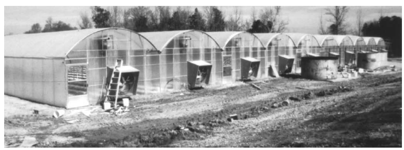
Shown are 10 greenhouse bays in a gutter-connected range (1/2 acre).

To determine how much acid to add to a bulk or concentrate tank of nutrient solution, take 1 gallon of solution and add 1 ml of acid at a time until the pH of the nutrient solution is within the range stated. Then, multiply the amount added to 1 gallon times the number of gallons in the tank. If