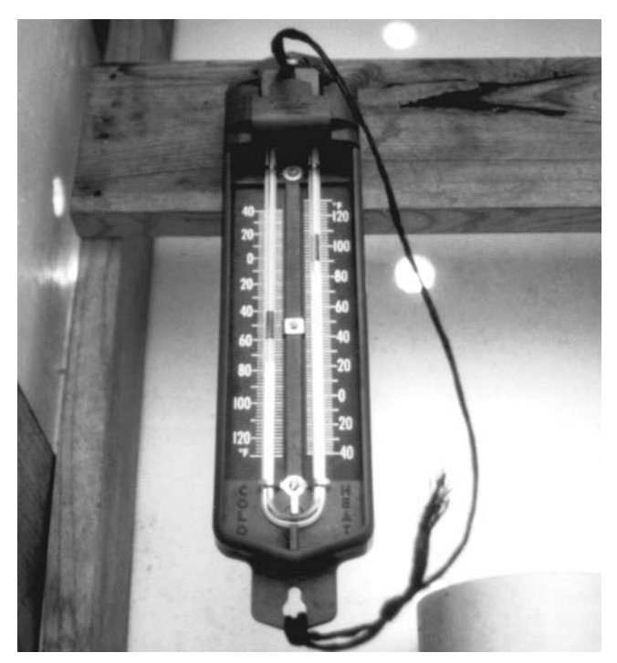
Use a thermometer that records the high and low temperatures.

The most common product is Kool-Ray, from Continental Products Co. This material is diluted with water; use 2 to 20 parts water for 1 part Kool-Ray, depending on the amount of shading desired. It is better to apply a thin coat early in the season (using more water) and then darken it later if needed. It is much easier to darken the shade than to lighten it once it has been applied. The ratio of 1 part Kool-Ray to 7 or 8 parts water has worked well in Mississippi. About 10 gallons of dilute solution covers a standard greenhouse (24 by 96 feet). It is best to apply it as small droplets and try to avoid streaking. Apply it during