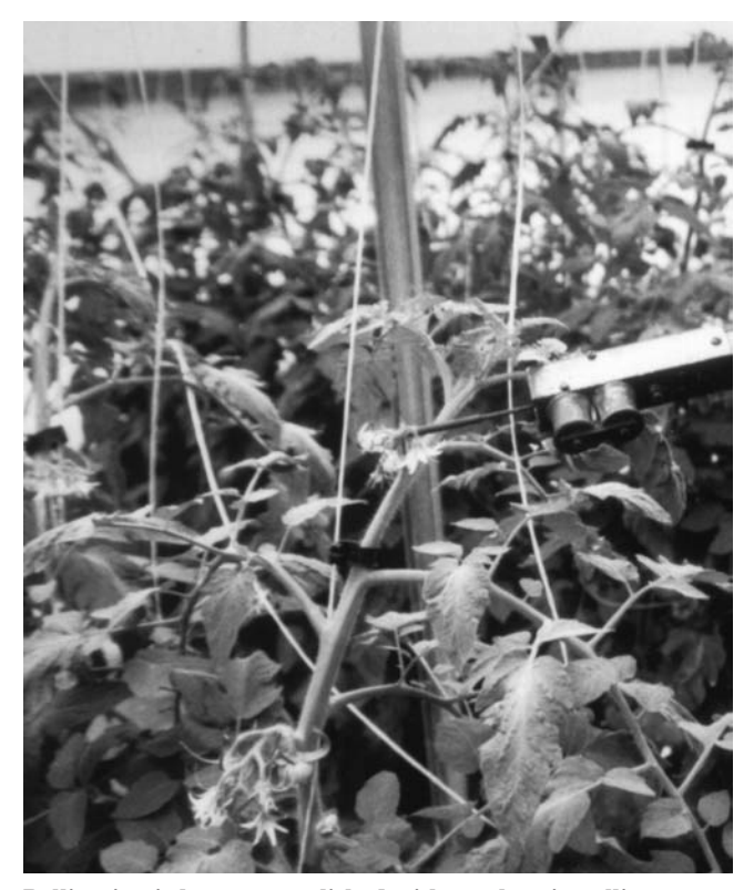
Pollination is best accomplished with an electric pollinator.

As you prune the plant to one main stem, wrap it around the support string. You can prune and wrap in one operation, doing both to a plant before moving on to the next plant. Always wrap in the same direction—if you start