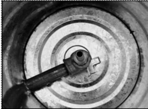
View inside bucket, showing pipe in position

Steel mesh is the ideal: 20 x 20 is the maximum mesh size; any bigger, and the pellets will fall through. Combs must be roasted in a crucible; the mesh will not contain the finer grind.