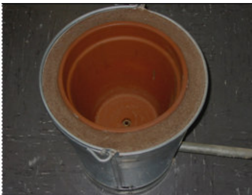
Finished Pellet roaster, minus wire-mesh basket.

Note: nipple protrudes half an inch above cement level.