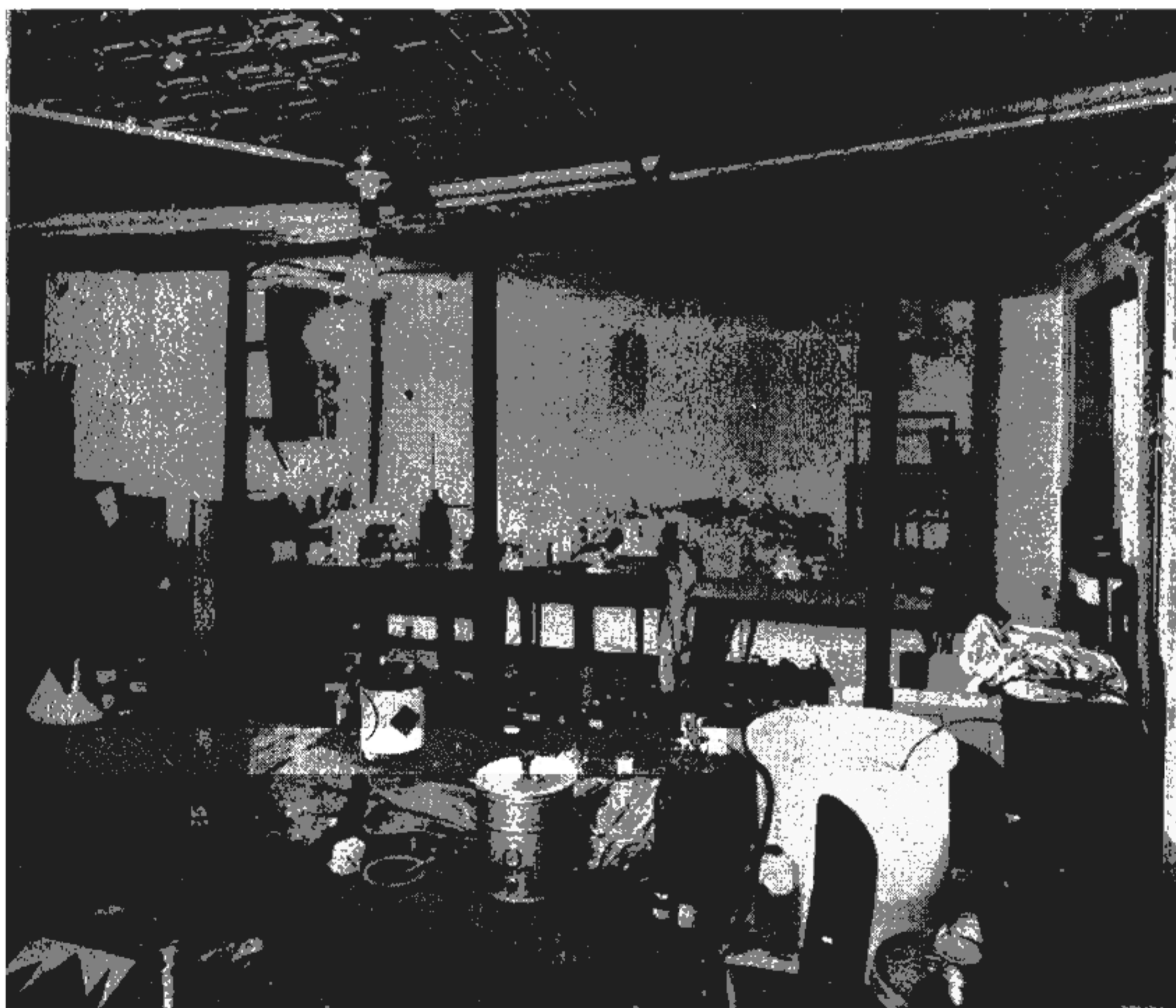
Fig. 1—Hallucinogenic drug laboratory. A drug from this disorderly laboratory might not only be unsanitary but might also contain a toxic chemical contaminant.

For the entrepreneur who is too busy to do his own scientific literature search, many of the methods have been prepared into booklets by other enterprising persons. These booklets sell for $1.50 to $2.00. One such publication has the title "Turn on Book," subtitled "Synthesis and Extraction of Organic Psychedelics." There is a question as to whether or not copyrights have been violated in the reprinting of legitimate scientific journal